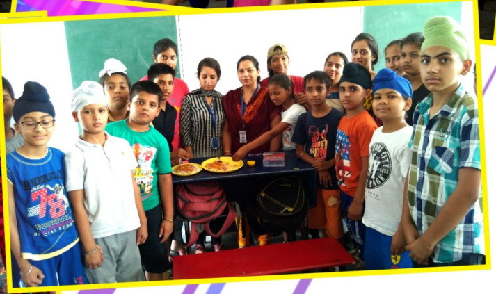
Cooking without Gas