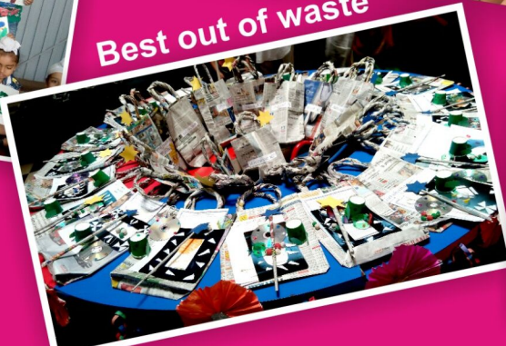
Best out of waste