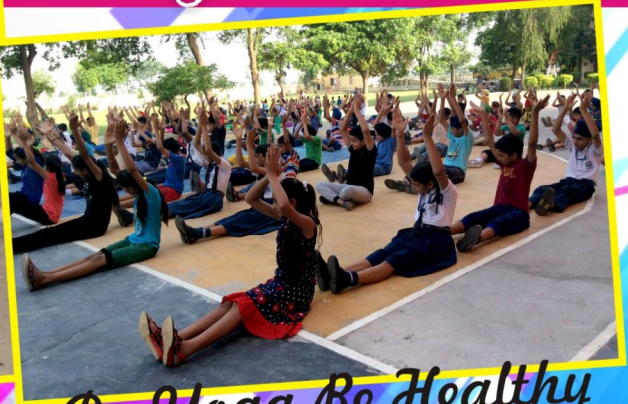
Do Yoga Be Healthy