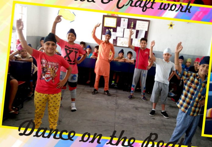
Dance on the Beats