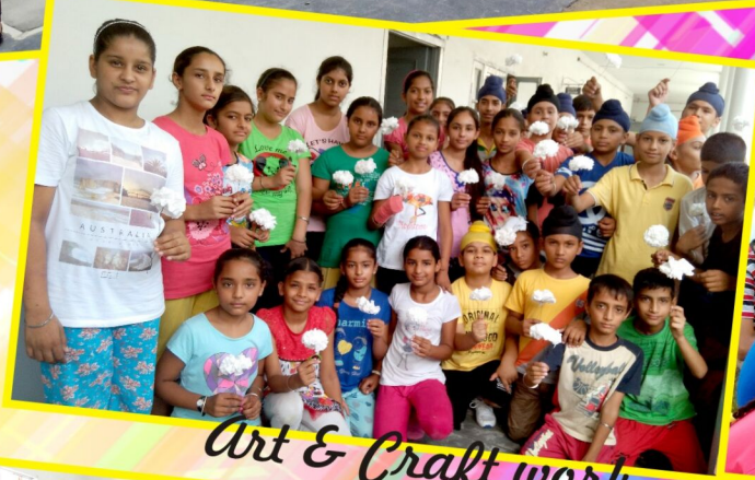
Art & Craft work