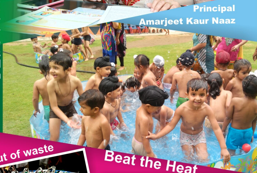
Beat the Heat