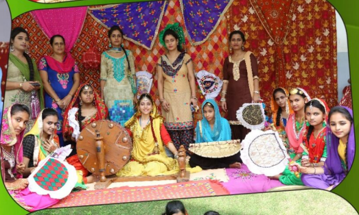
Winners of Mehandi Competition